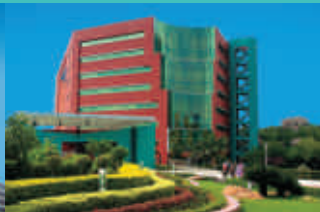
The V, Hyderabad