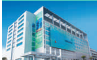
International Tech Park Chennai

CHINA INDIA INDONESIA JAPAN MALAYSIA OMAN PHILIPPINES SINGAPORE SOUTH KOREA THAILAND VIETNAM