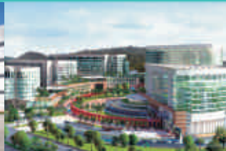
International Tech Park Pune